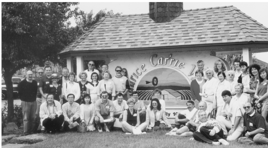
Wine Tasting in the Temecula Valley

The City took the hosting of ITER very seriously. A special San Diego Site for ITER Committee was created to facilitate ITER Joint Work siting in San Diego. A lot of thinking was including in preparing and organizing the support. Deep interest to the project has been generated and cultivated for all six years. The San Diego Site for ITER Committee not only won the ITER hosting in a competition with other contenders but continuously supported the Site for all six years.