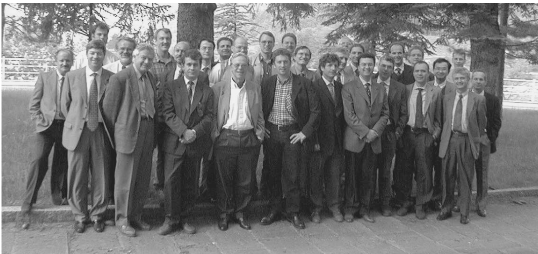
Fig. 3 - Participants in the Meeting

The next L-5 Meeting is provisionally scheduled for April 2000 in Naka.